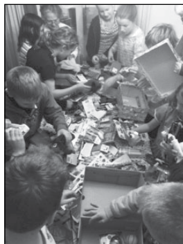
Packing up the shoe boxes