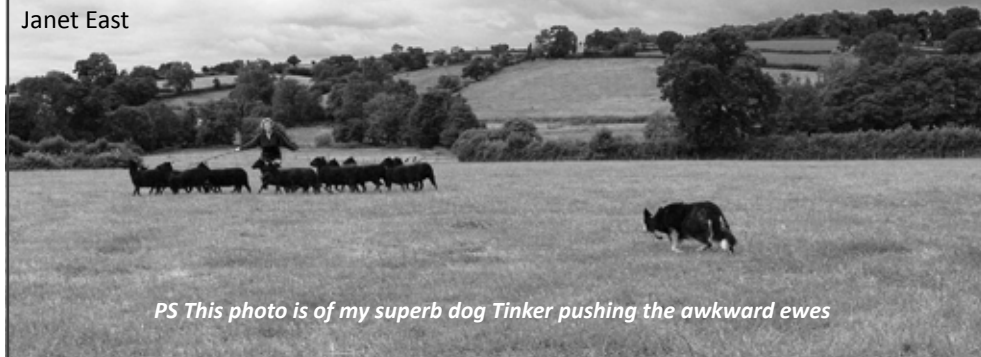
PS This photo is of my superb dog Tinker pushing the awkward ewes