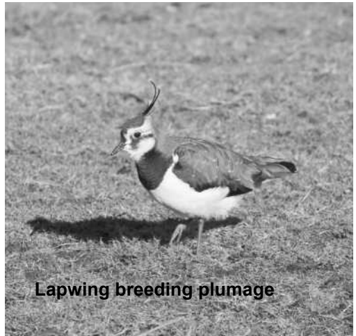
Lapwing breeding plumage

Our pond sprang a leak just at the wrong moment – the frogs had started to mate and so dollops of spawn have been distributed around the village.