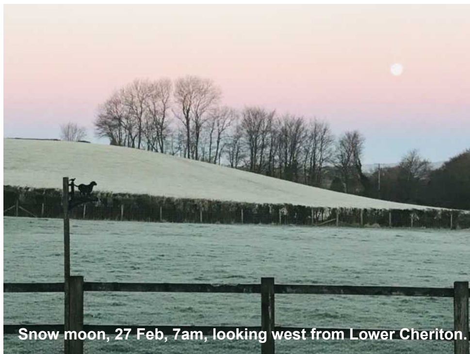
Snow moon, 27 Feb, 7am, looking west from Lower Cheriton.