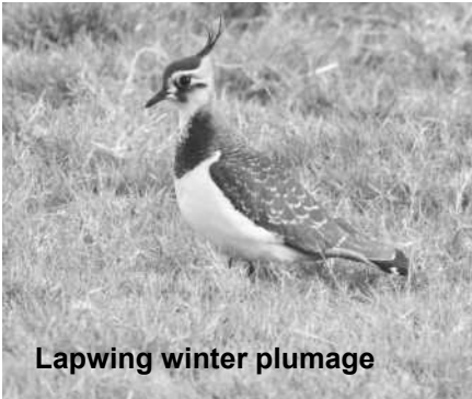
Lapwing winter plumage

Then, of course, the wet weather and a prolonged period of cold returned just to remind us that nature always holds the upper hand.