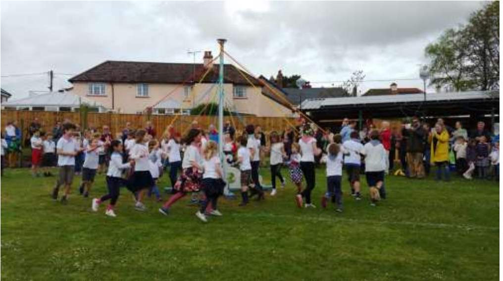
Payhembury May Day Celebrations 2017

Let's hope we will be able to celebrate the occasion in 2022!