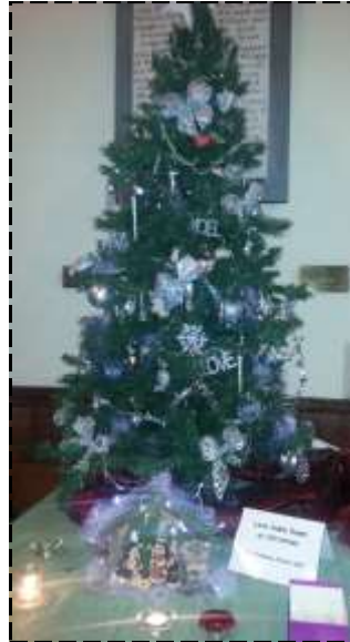
Payhembury Parish Hall