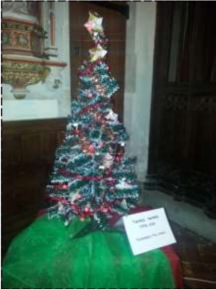
Payhembury Pre School

A total of approximately £325.00 was raised for church funds, so well done! Thank you, Babs Leach