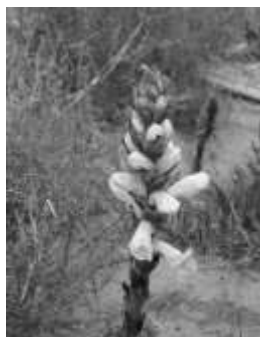
Desert Hyacinth (yellow)

Margaret and I have just returned from a nature holiday in southern Portugal, a wonderful area for birds and wild flowers in the Spring. What did we see?---only Spanish Imperial Eagles, bustards, black shouldered kites and many other exotic birds. If you'd like to know more, do get in touch---I've got lots of photos, but mainly of flowers, which were beautiful.